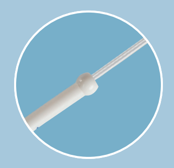
The Tulip L Rigid round shaped bulb