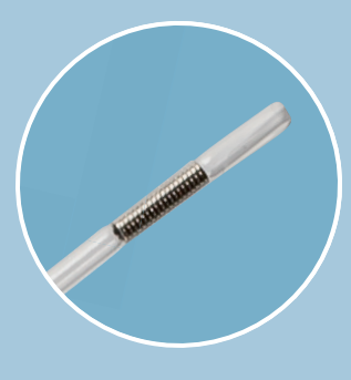
Tip-in-Sight (TIS) Echogenic