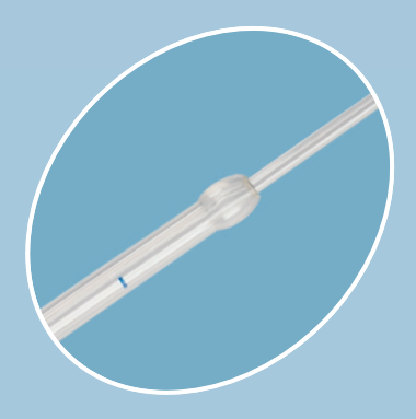
The Tulip S Oval shaped bulb