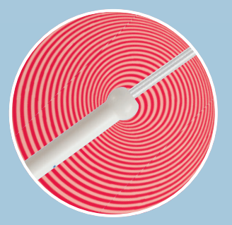
The Tulip LS SOFT round shaped bulb